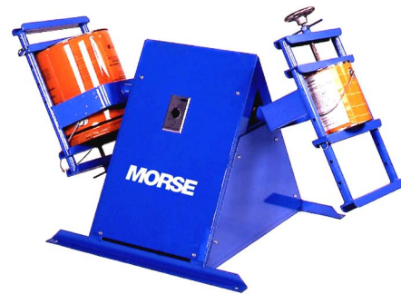
Model 2-305-1 shown