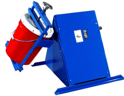
Model 1-305-1 shown