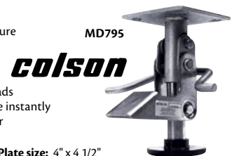
Plate size: 4" x 4 1/2"

Holes slotted for: 2 5/8" to 3" x 3" to 3 5/8"